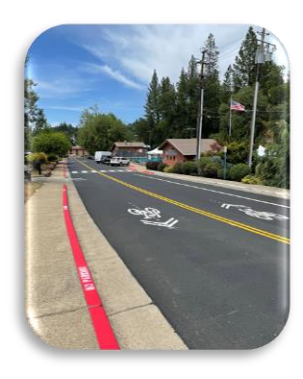
*Projects funded by other revenue sources.